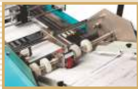
Automatic friction feeder feeds a single paper at a time