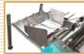
Extra Long Collection Tray